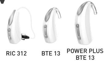
RIC 312 BTE 13 POWER PLUS BTE 13